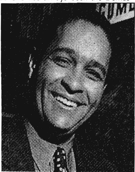
Is Gumbel flopping again?

Since CBS has always been the Demos' favorite